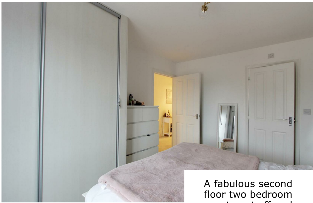
A fabulous second floor two bedroom apartment offered with no onward chain.